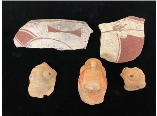
14. Caribbean Saladoid