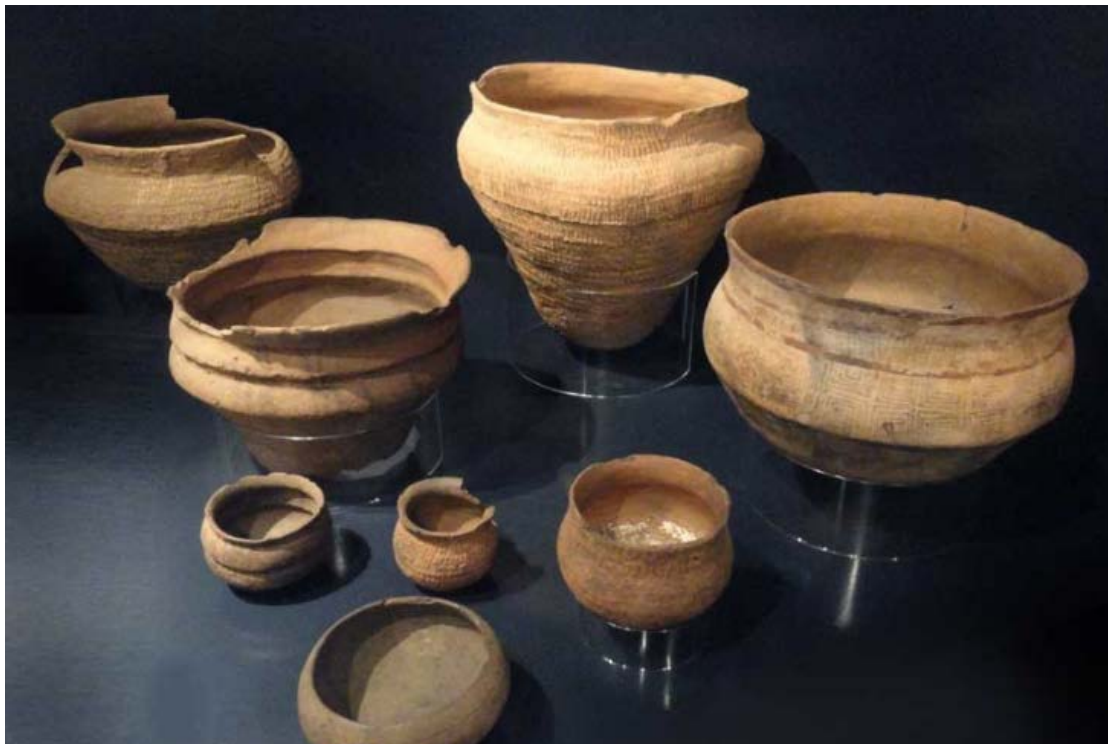
7. Paraguay