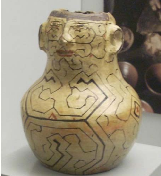
9. Shipibo-Conibo, Amazonia